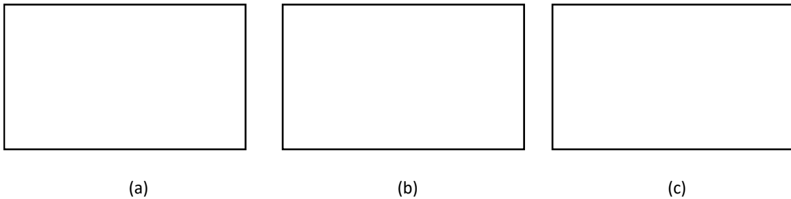
Figure 2. Figure Header, (a) Xxxxx, (b) Xxxxx, (c) Xxxxx

Relation of Tables, Figures, Photographs and Text: Because tables and figures supplement the text, all tables and figures should be referenced in the text. Authors also must explain what the reader should look for when using the table or figure. Focus only on the important point the reader should draw from them, and leave the details for the reader to examine on her own. Please ensure that the figures are large enough to be clearly seen after reduction.