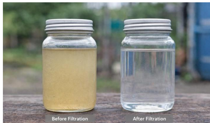
Figure 3. Visual comparison of harvested rainwater before and after filtration.

retention. To provide a direct visual representation of the improvement in physical water quality, a comparison of harvested rainwater samples before and after filtration is presented in Figure 3.