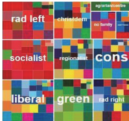
Image 2. Relationship between colour and political party ideologies (Marini, 2017, p. 10)

Using the colour guidance above, this study interprets several colours of Indonesian political icons - yellow, red, blue, and red-black-white (plaid). These colours were selected as prominent political colours in the Indonesian history of politics. These colours will be compared with the relationship of colours designed by Marini (2017) based on the colour classification. This colour classification is used as a control group to signify the objects of the study.