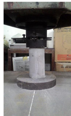
Figure 2. Compressive strength testing

The compressive strength and the shear bond strength of the cement slurry were tested at 7, 14, and 28 days. In each testing, three specimens of each variant were tested to find the average compressive strength and three specimens of each variant were also tested to find the average shear bond strength of the slurry cement. The Universal Testing Machine with the capacity of 30,000 kgf was used to conduct compression and shear bond test of cylinder specimens. The compressive strength and the shear bond strength were tested following the American Petroleum Institute (API) Specification 10A (see Figure 2 and 3).